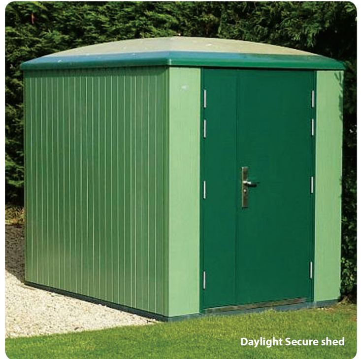
Daylight Secure shed